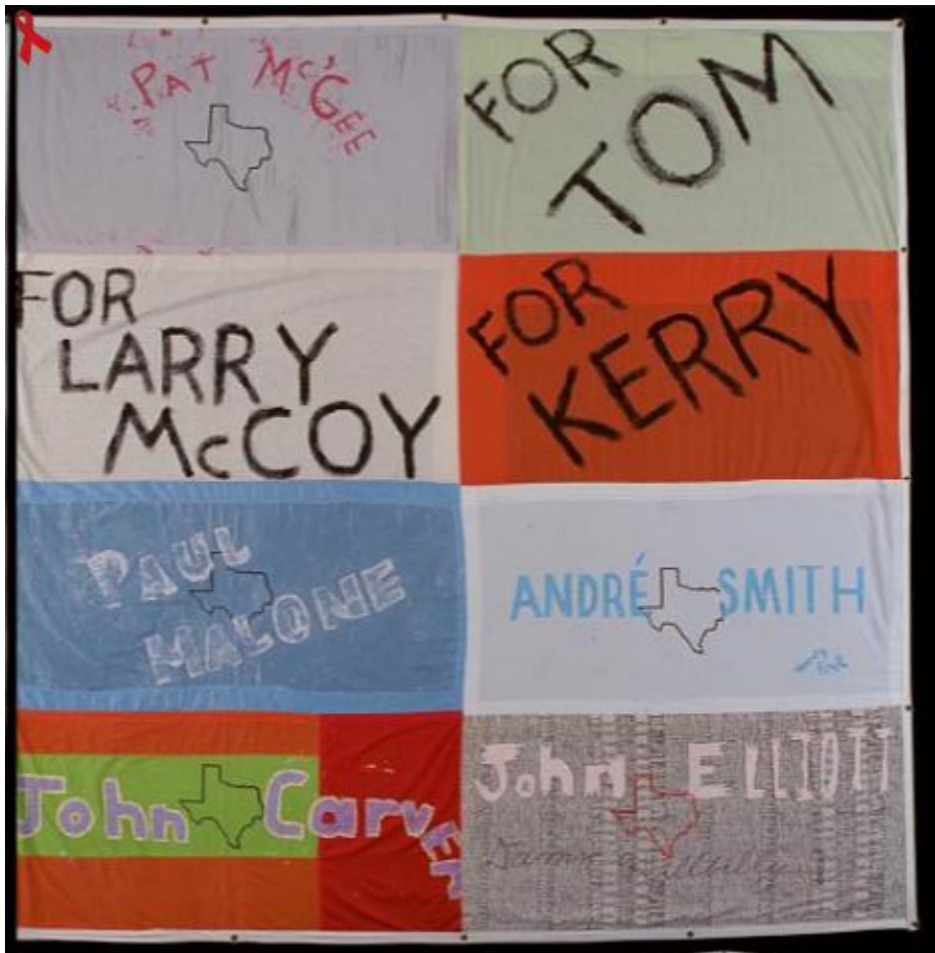
Names on Block #115

Leader -3: Hello. My name is _____. I am in_(city) _____, _(State)_____. Scroll the page to see the panel names on Block # 115.